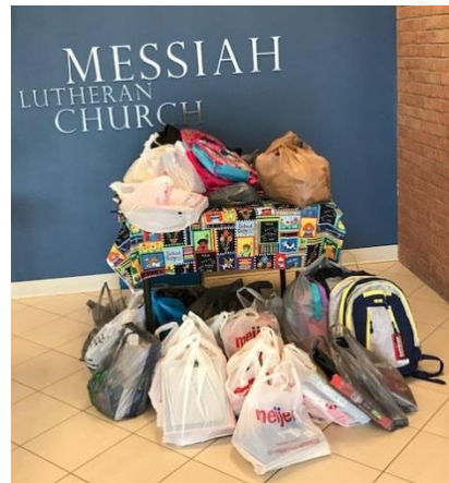
Thank you to everyone for your overwhelming response to our school supply drive. These supplies will go a long way to help children start off the school year on a positive note.

We are looking for a couple of volunteers to sit at the front desk during the school year. Currently we need someone from 12:30 to 3:00 pm on Thursday and Friday, and 8:45 – 11:30am on Friday morning. You would simply greet our preschool parents and children as they enter and help with the phones, etc. Please call the church office if you think this is something you might like to do (614-866-4386).