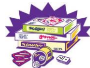
20's and 30's Game Night

The outdoor program will consist of vendor information tables, a mobile game room, Military vehicle display, face painting, rock climbing wall (weather permitting), child finger printing, face painting, K-9 dogs, local municipal SWAT and fire vehicles. I am also working on a celebrity dunk tank, business mascots and a 200 balloon sendoff affixed the name of child still missing. Mark your calendars and plan to attend.